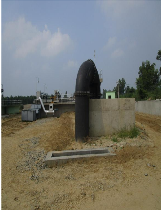
MAIN PUMPING STATION INLET:-